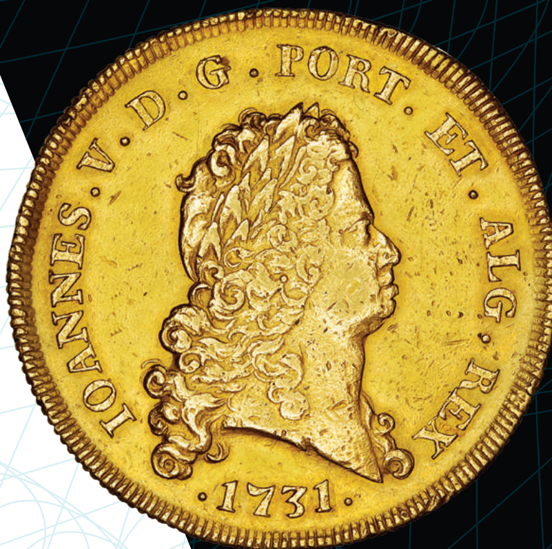
Dobra , worth 16 escudos or peça (25 600 réis) Trial strike | King John V | Lisbon | 1731 | Gold

The Money Museum reaches out and fosters dialogue, knowledge and critical thinking, through educational and cultural programmes for all ages, for the whole community.